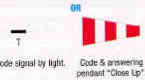
Morse code signal by light.