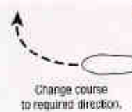
Change course to required direction.