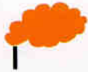
Orange smoke flare.

You have been seen, assistance will be given as soon as possible.